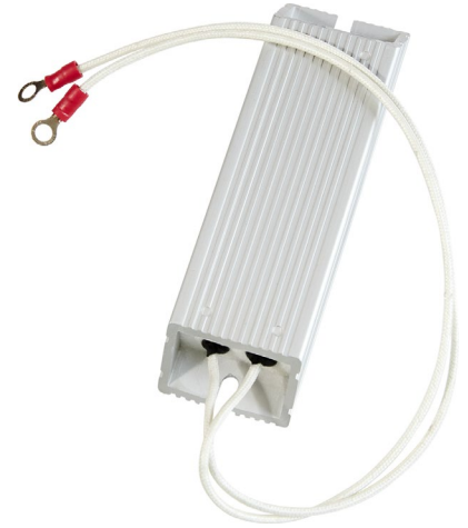
Aluminum Resistor JBR-BS